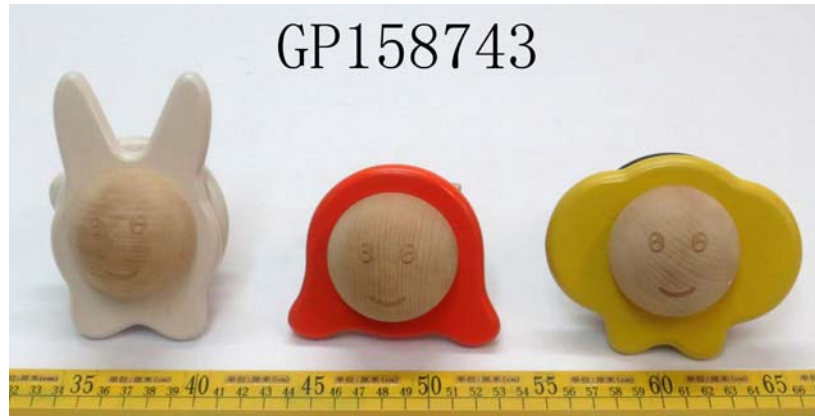
PHOTOGRAPH(S) OF THE SAMPLE