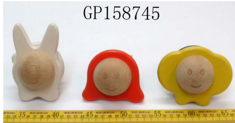
PHOTOGRAPH(S) OF THE SAMPLE